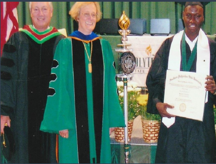
Graduation at Southern polytechnic State University