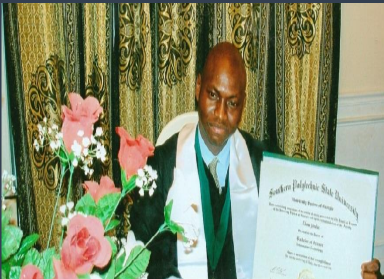
Graduation day at Oak Park Square

My passion for entrepreneurship also represented a contributive factor why I chose commerce. As a commerce student, I focused on Business Management, Commerce as a subject, Economics, Statistics, Mathematics, English, and Accounting and obviously these subjects matched my goals to work as a banker or be an entrepreneur. After five years in Muslim High School, I sat to The General Certificate Examination referred